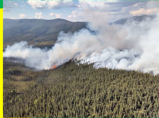
The Munson Creek Fire near Chena Hot Springs east of Fairbanks backs and creeps through black spruce on Thursday, August 5.